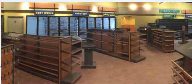
▲ McCowan's unique modular systems, combined with its in-house design team and modern production facilities, allow it to create cost-effective custom store fixture solutions for independent retailers and national chains.

Naturally, the business and its customer demographics had changed over four decades. The owners understood who their customers were and what they wanted. They also had an idea of the changes they did and did not want. They needed new product offerings, but without sacrificing their core business. Unsure how to make it all happen, they decided it was time to get professional help.